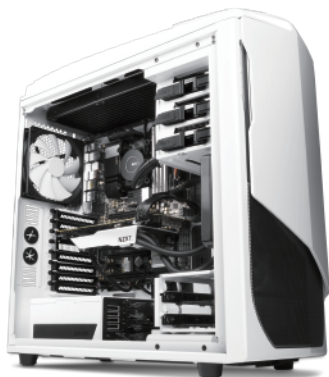
GTX-780 stock cooler vs. NZXT Kraken G10 & Kraken X40 Min Max

*Tests performed using a Kraken X40 and stock GTX-780