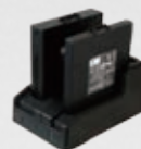
2-bay Battery Charger