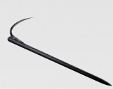
IP54 Digitizer Pen